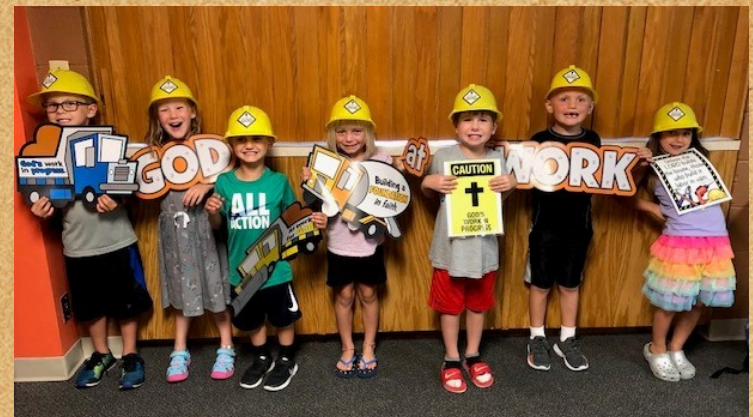
Oldest STARS crew (above) and youngest STARS crew (right)