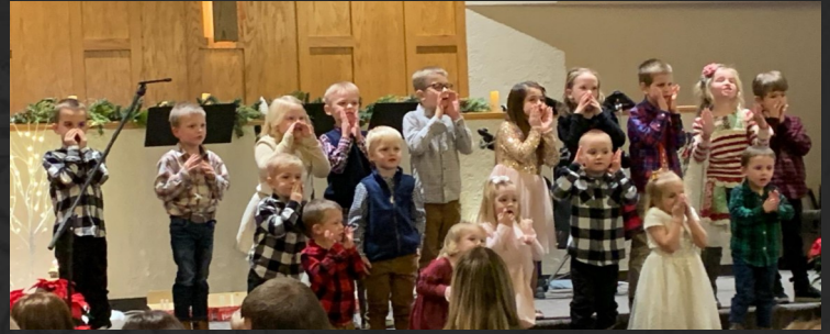
Above: Beginner Department (3 yrs—Kindergarten) Below: 1st—4th grade