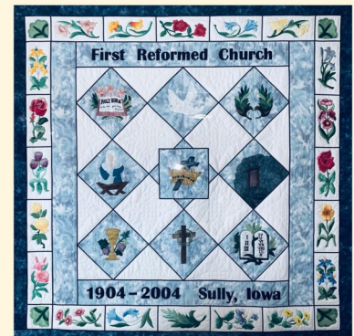
First Reformed Church Sully, Iowa