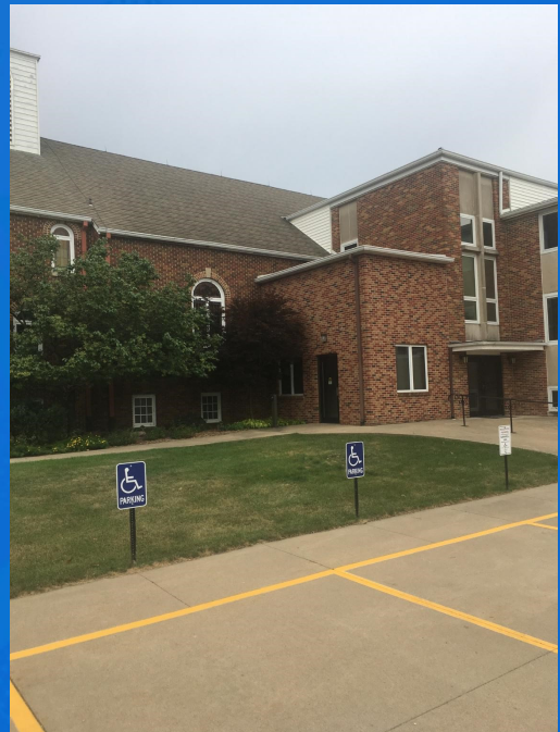
STORM DAMAGE 2019 - "Now you see it, now you don't!"